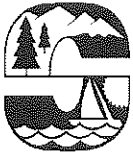
EXHIBIT A Snohomish Health District 2012 Staffing levels

Following is a table showing program by program staffing numbers for each Division in 2012. All numbers refer to Full Time Equivalent positions (FTEs).